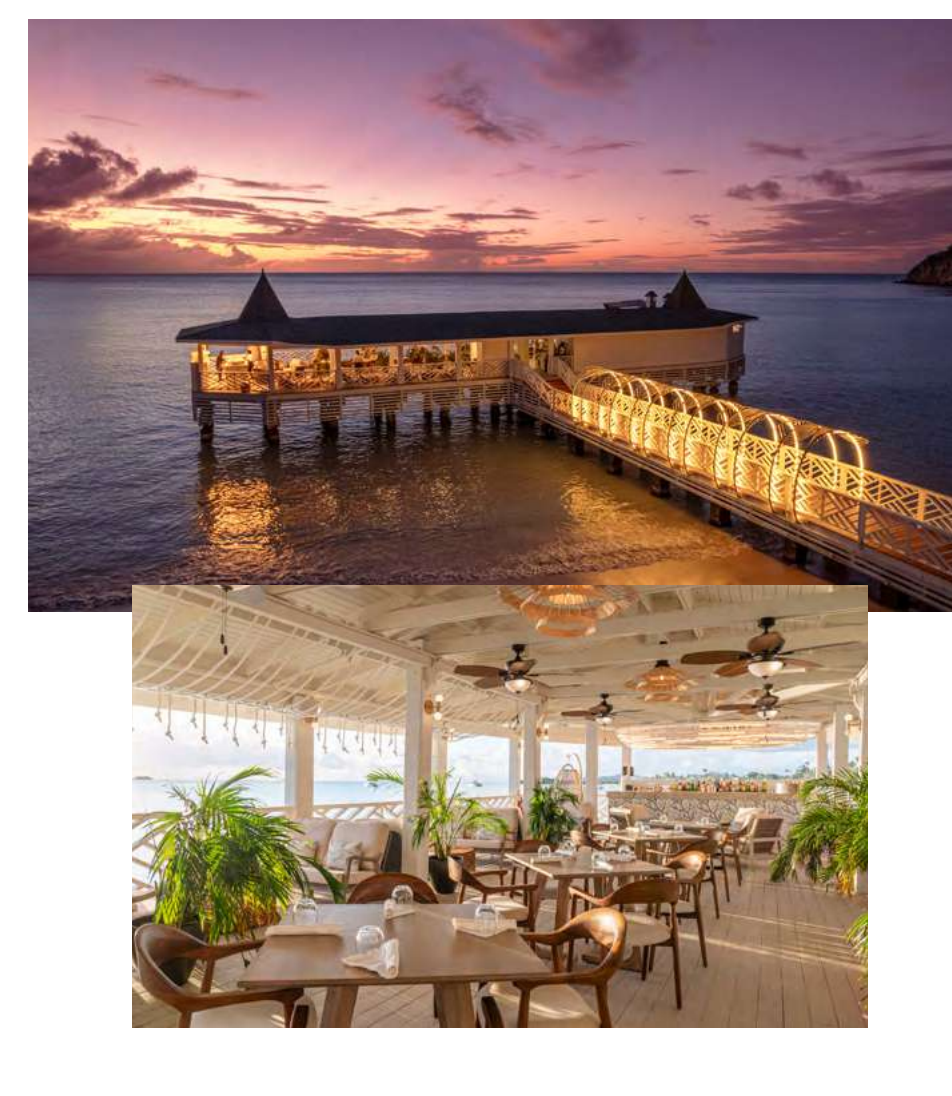
*Lunch & Dinner ($), Diamond Club™ included **Charges apply

Diningtainment has come to Antigua! This unique concept arrives to this idyllic destination in an overwater restaurant that will fascinate everyone's palate while the CHIC Angels will be the hosts of every event creating vibrant moments every time. Unforgettable sunsets and highspirited days will be lived in this distinctive eclectic venue.