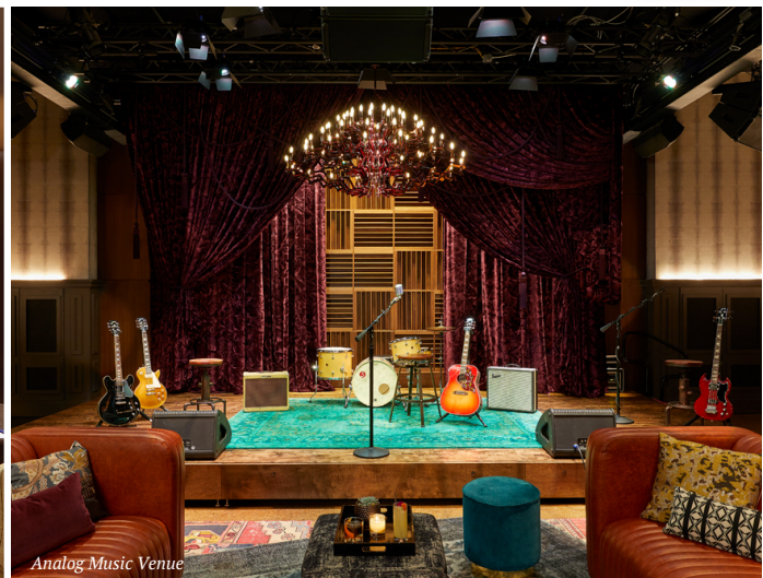
Analog Music Venue