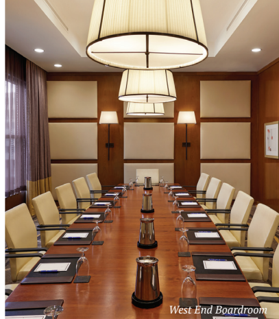
West End Boardroom