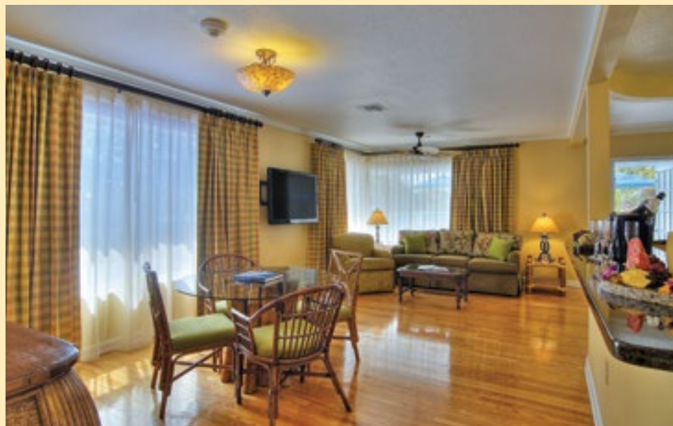
Cypress Villa with Large Balcony Terrace