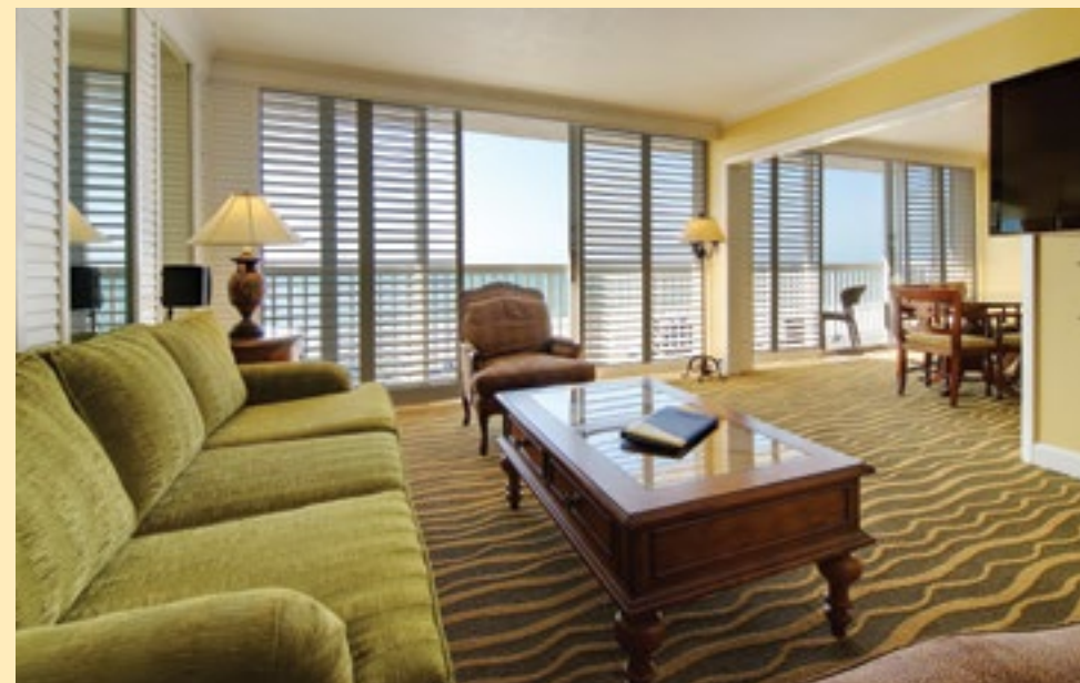
5 Penthouses with 2 Bedrooms