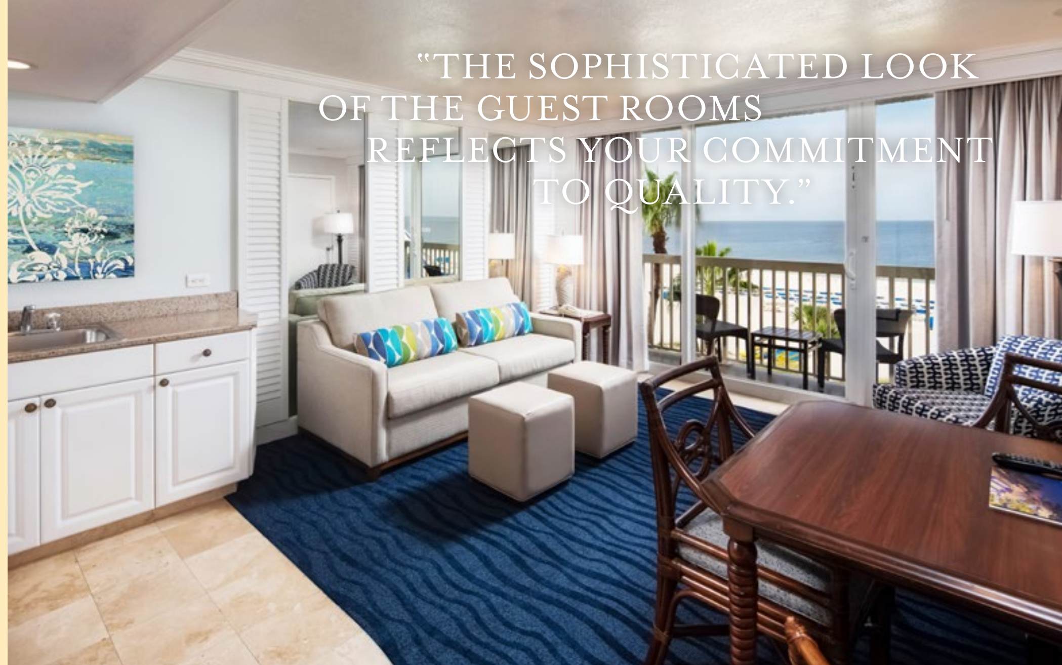
Gulf Front Suites

Our nearly 600 lodging options offer a wide variety of choices, and include hotel rooms, 1-bedroom suites with separate living area, 2-bedroom suites, 2 whirlpool suites, 5 penthouses and a 2-bedroom villa.