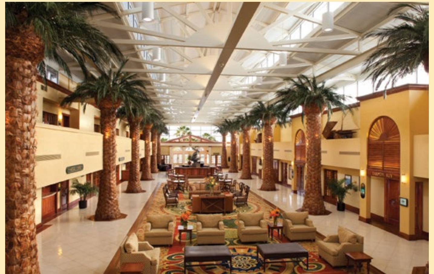
Grand Palm Colonnade

“TRADEWINDS HAD SO MANY DIFFERENT OPTIONS FOR OUR MEETINGS AND FUNCTIONS. EACH ONE OF OUR EVENTS WAS UNIQUE.”