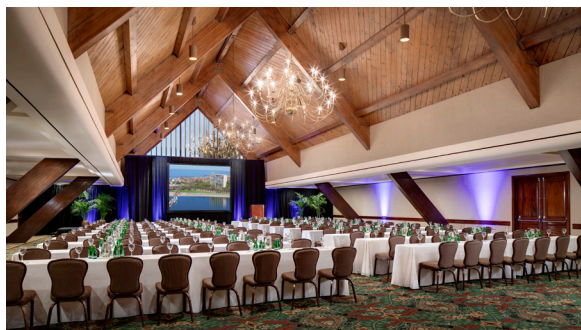
KON TIKI BALLROOM