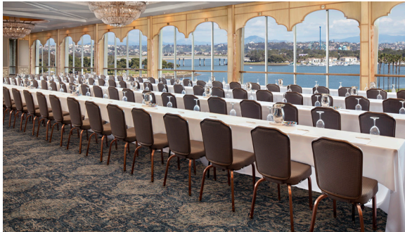
MISSION BAY BALLROOM

The Bahia offers 14 meeting spaces with nearly 20,000 square feet of flexible space with natural lighting and a full range of floor plans. The marquee space, the Mission Bay Ballroom, can accommodate up to 880 guests and sits on the top floor of the resort with stunning views of the bay and the downtown skyline. Unique to San Diego, the Bahia has a pair of Victorian-era Mississippi riverboats called the Bahia Belle and William D. Evans that cruise around Mission Bay. The William D. Evans is equipped to host 450 guests while the Bahia Belle can accommodate up to 130. The sternwheelers provide all the modern amenities while maintaining 19th-century grace and charm.