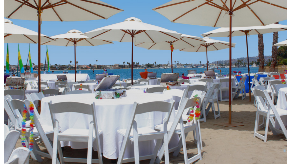
WEST BAY BEACH