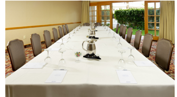
LA JOLLA ROOM